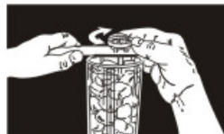
POCKET CASE AS WRENCH

The thermometer will withstand drops to the floor without damage or major calibration shift. If, however, it appears to be inaccurate, immerse the thermometer stem at least 2" in an ice slurry (32°F). Determine the degrees of inaccuracy. Then, with hex nut in the molded wrench on the sleeve (US Patent # 5,775,488), rotate the thermometer head to correct the error.